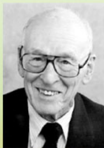
Prof. Paul D. Boyer

“ There Would Not Be Life Without Enzymes!! ”