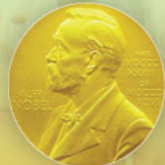
Nobel Prize In Chemistry 1997

“ There Would Not Be Life Without Enzymes!! ”